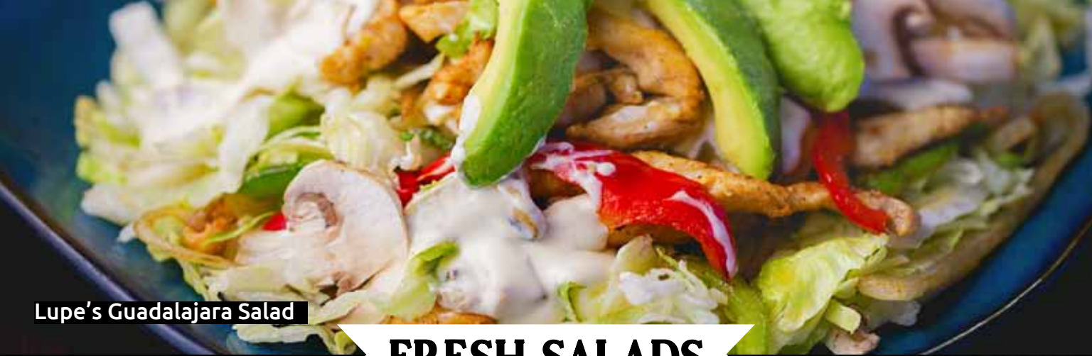
Lupe's Guadalajara Salad