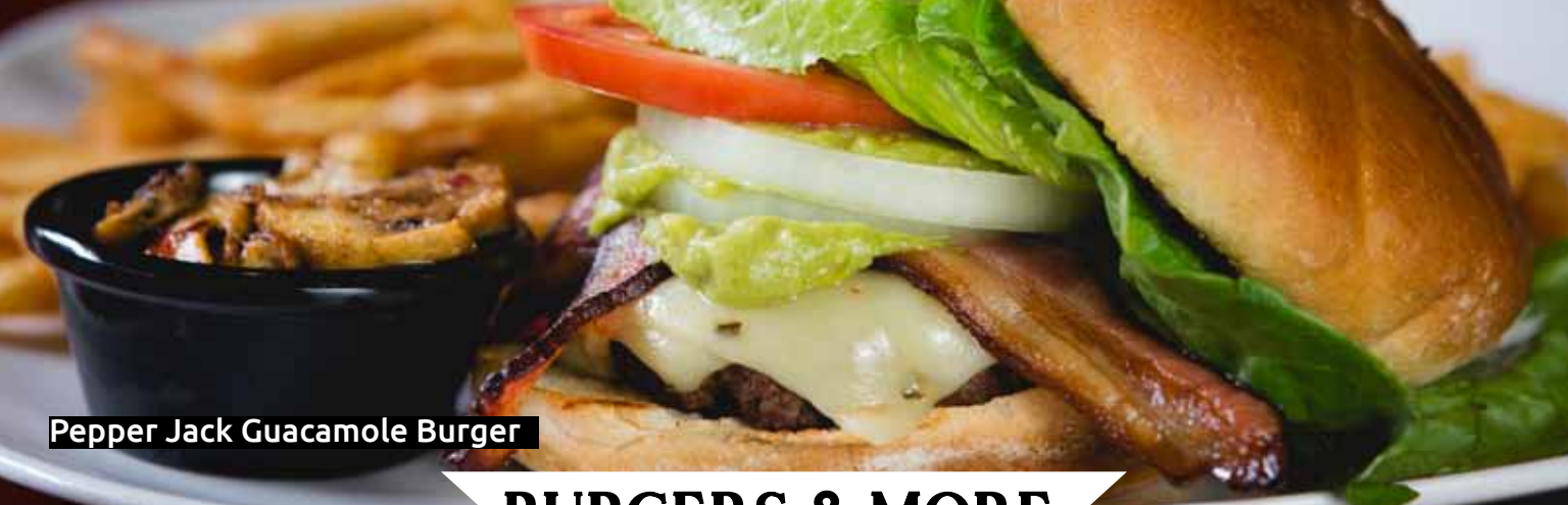
Pepper Jack Guacamole Burger