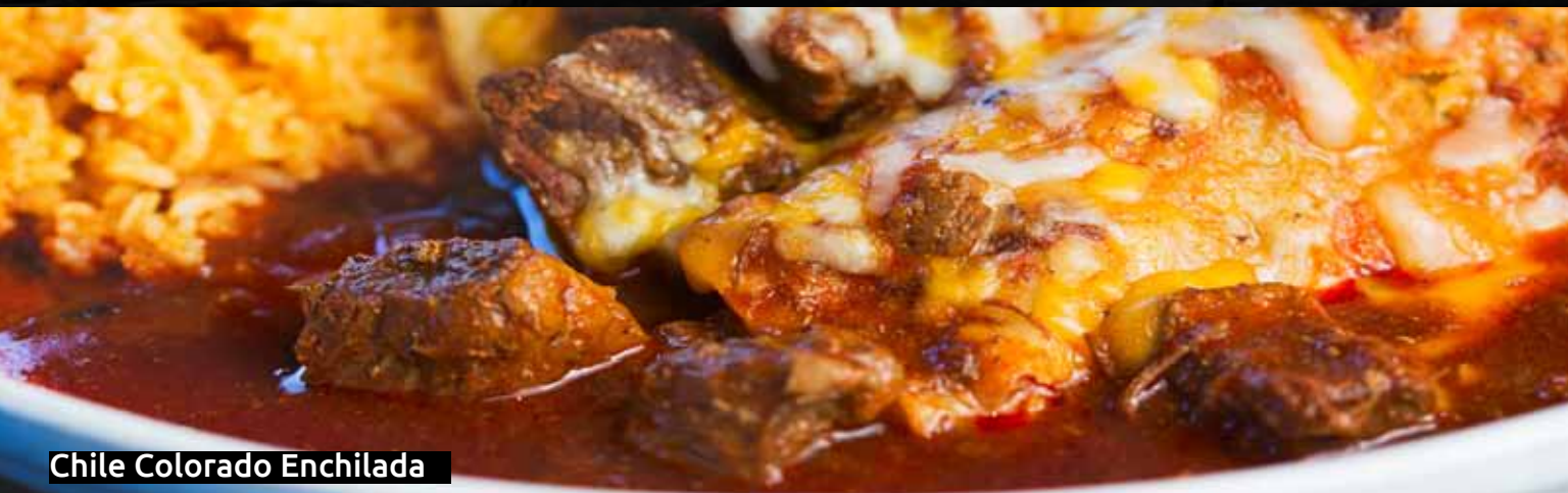
Chile Colorado Enchilada

SEASONED GROUND BEEF • SHREDDED CHICKEN • CHEESE • BEANS