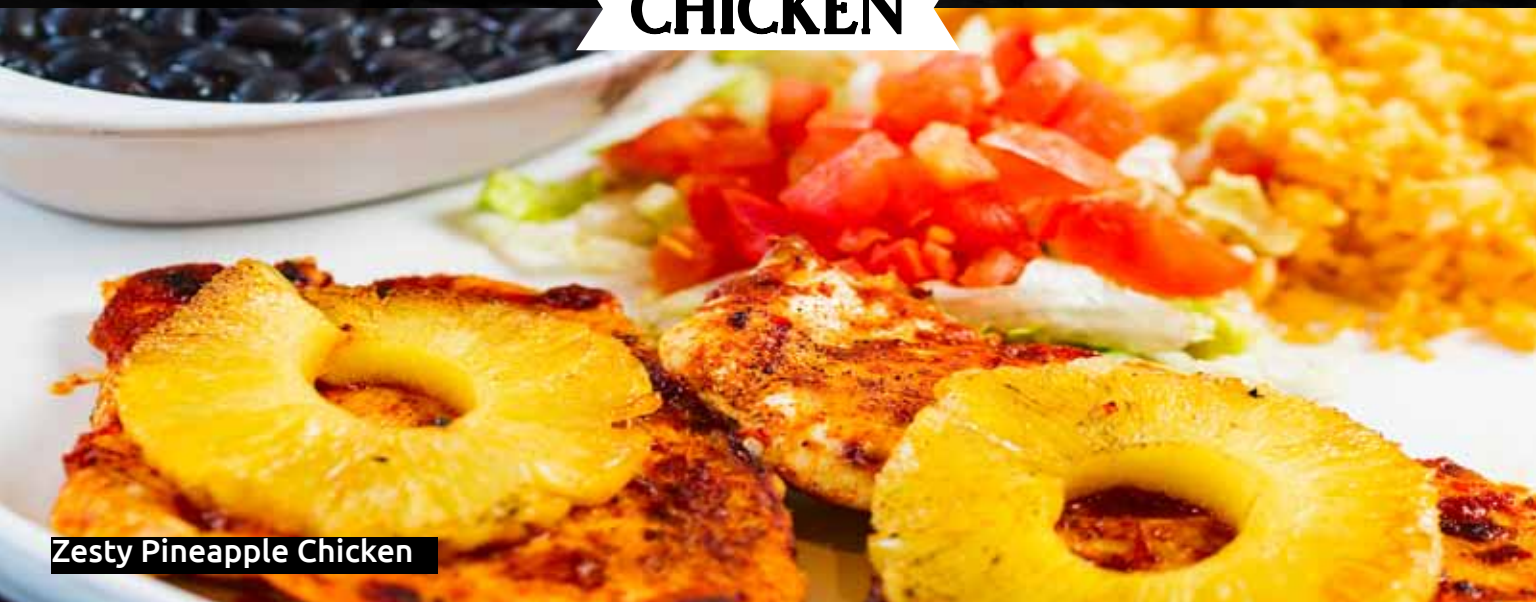
Zesty Pineapple Chicken