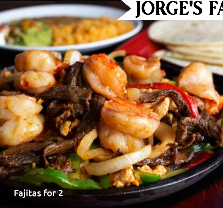
Fajitas for 2

We'll deliver them sizzling on a skillet with onions and green peppers, along with warm tortillas, lettuce, tomatoes, and THE WORKS. Comes with Spanish rice and homemade refried beans. Add grilled pineapple chunks $0.50. GF with corn tortillas!